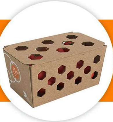
Punnet with lid