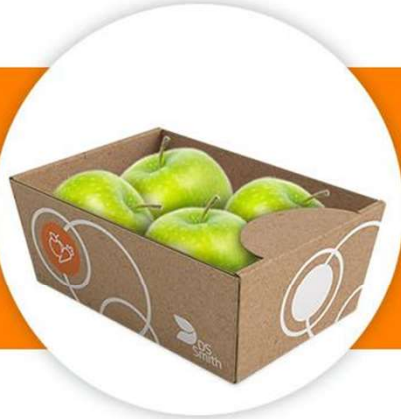
Open top punnet